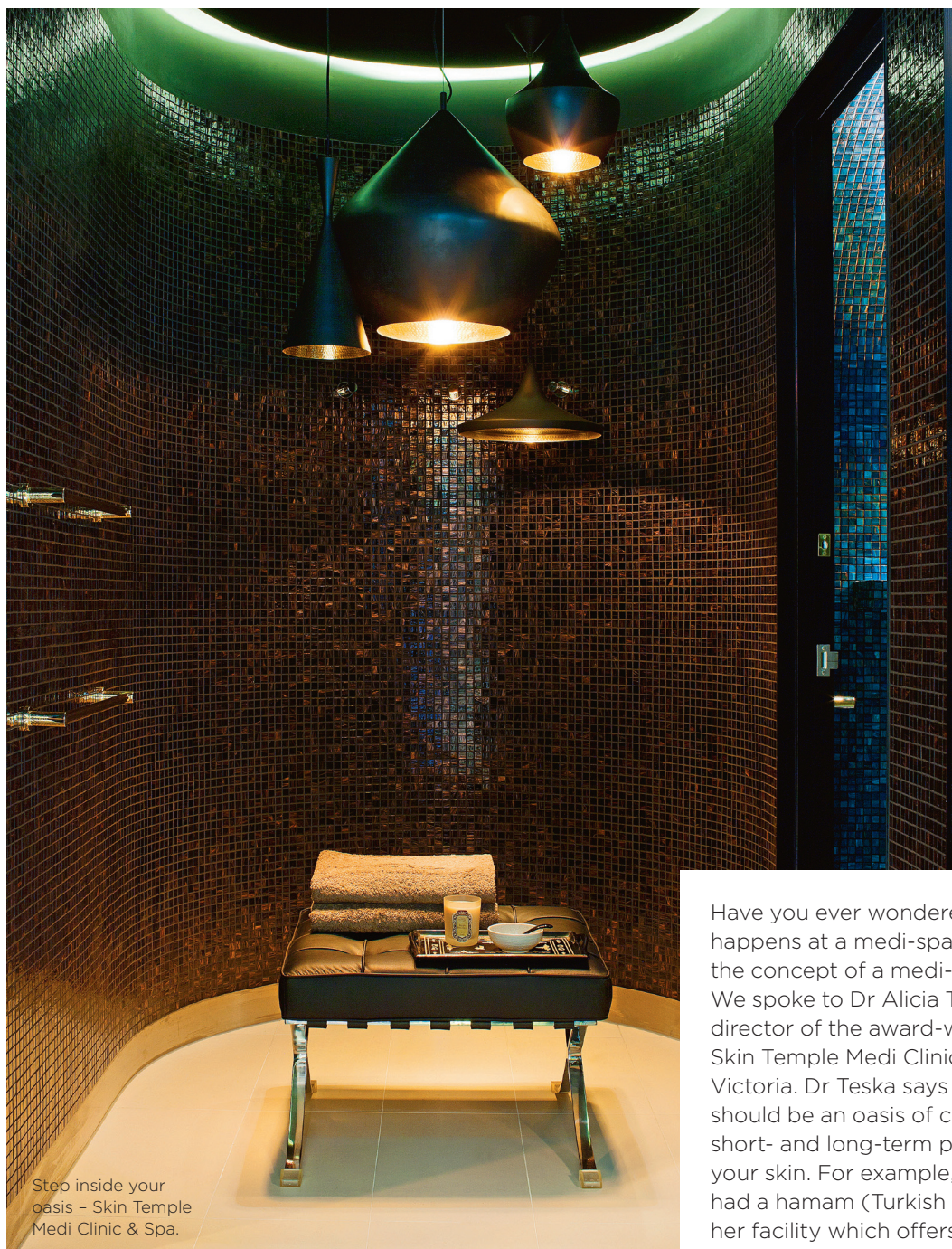
Step inside your oasis – Skin Temple Medi Clinic & Spa.