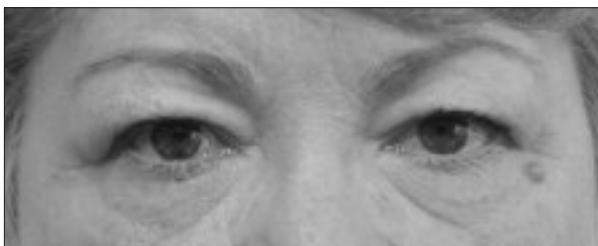
Actual Patient Before

Blepharoplasty is an operation designed to remove excess skin folds and bulging fat bags. It rejuvenates the upper part of the face, making you look fresher and more relaxed, and feeling more self-confident. Blepharoplasty is often combined with a browlift to lift sagging eyebrows or a facelift or necklift to improve the lower part of the face.